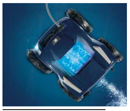
Patented cyclone technology