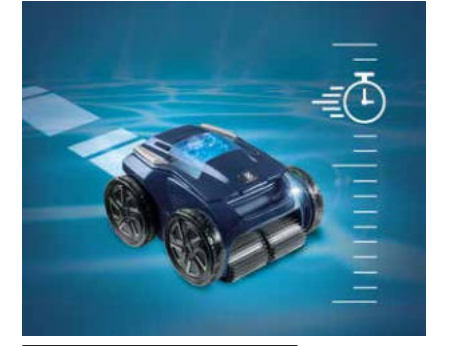
Personalised cleaning SENSOR NAV SYSTEM™

With their 4WD technology and app control, the robots from Zodiac are well-suited helpers. The RA 6700 IQ also offers you an even greater range for cleaning larger ponds with its 21 m cable length.