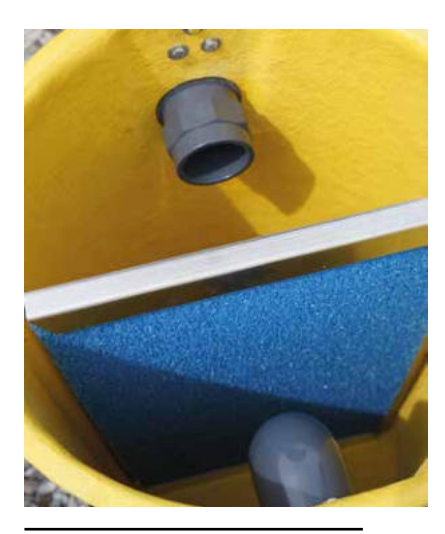
Filtration with the perforated filter sieve and sponge filter

Depending on the type and the amount of dirt, working with an insert can be useful. The perforated filter sieve is particularly helpful in the case of leaf ingress or thread algae.