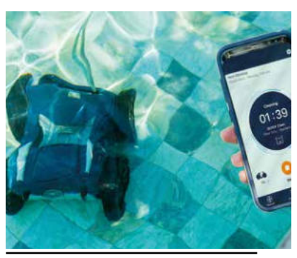
Operation via smartphone or tablet via free Fluidra Pool app