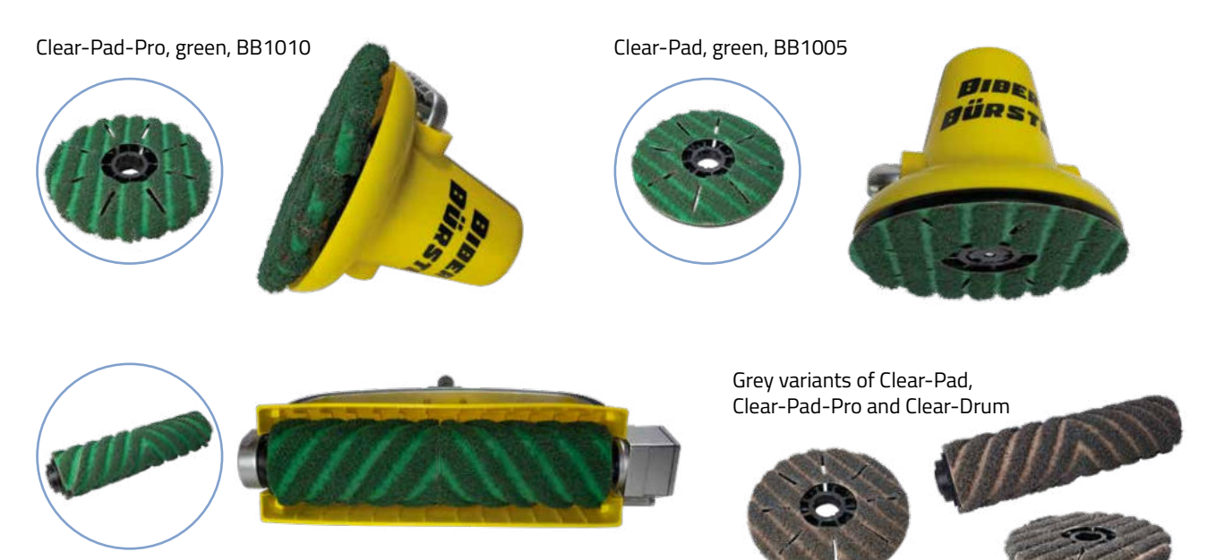
Clear-Drum, green, BISAM1016, see page 28