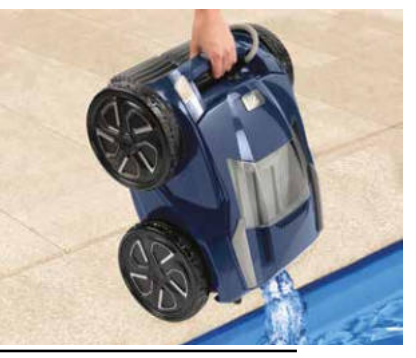
Lift System: Easy removal from the water