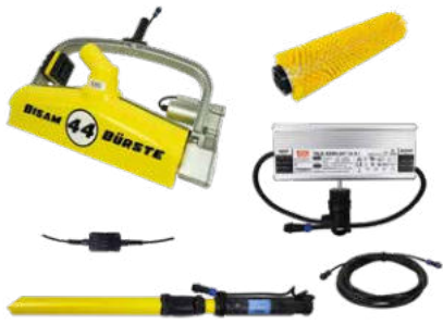
Power supply version, BISAM1100NT