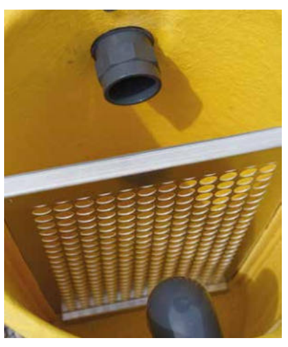
Filtration with the perforated stainless steel filter sieve

Gravity causes heavy objects such as stones and lumps of dirt to sink to the bottom of the container and be filtered out.